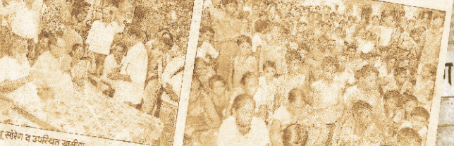
सोरेण व उपस्थित ग्रामीण